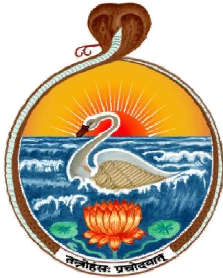
Emblem of the Ramakrishna Mission designed by Swami Vivekananda

“The wavy waters in the picture are symbolic of Karma, the lotus of Bhakti and the rising-sun, of Jnana. The encircling serpent is indicative of Yoga and the awakened Kundalini Shakti, while the swan in the picture stands for the Paramatman (the Supreme Soul).